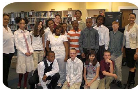
Francis Scott Key graduates

Investors Graduate - Congratulations to 104 Stocks in the Future (SIF) students at Barclay, Francis Scott Key, Deep Creek and Dundalk Middle Schools who celebrate their eighth grade graduations AND walk away as stockholders. They earned money to invest in the stock market by attending class regularly and improving grades. Over the next years they will track their portfolios online, be able to buy and sell their investments, and when turning eighteen, own the shares in their own names when graduating from high school.