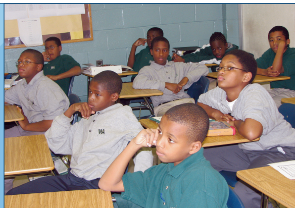
A 6th grade SIF class at Washington Jesuit Academy