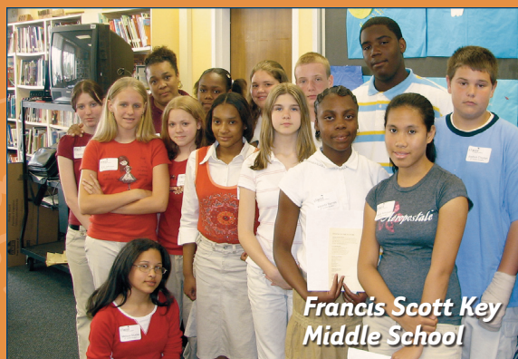
Francis Scott Key Middle School

"The results show a consistently positive impact on student achievement and attendance. Students are attracted to the program's real world application."