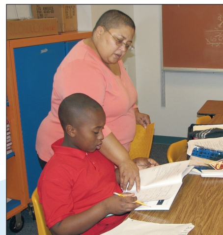
A 6th grade SIF class at Oakland Mills Middle School

"It's not a program about money. It's about sticking to a goal and meeting it."