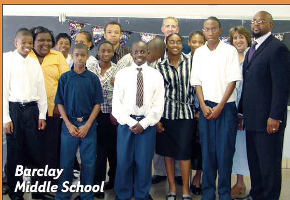
Barclay Middle School

After attending SIF classes for three years, Barclay and Francis Scott Key Middle Schools celebrate with 22 and 21 graduates respectively. Of those, 26 were members of the "100+ Club", who earned more than $100.